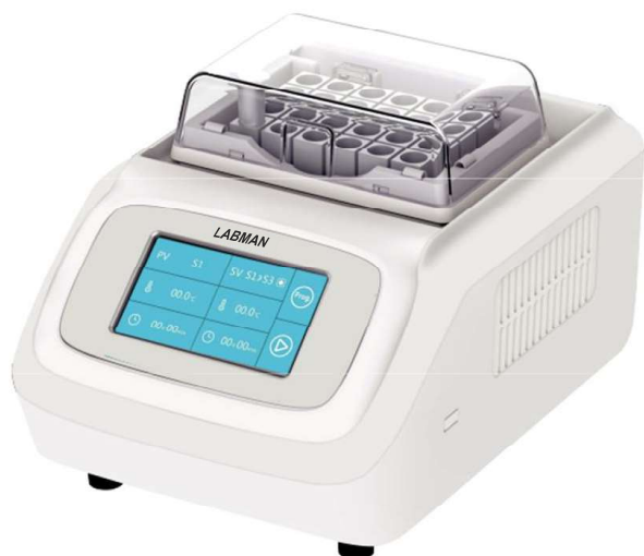
Touch Screen DBI11T