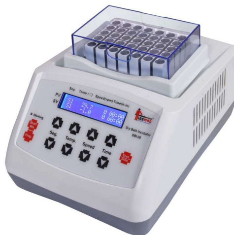
DBI18 & DBI20